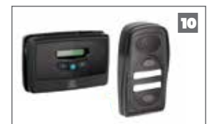
Wireless intercom systems Answer your intercom and open your gate from anywhere for maximum security and convenience