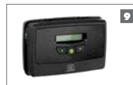
G-ULTRA GSM device The ultimate new GSM solution for monitoring and activating the operator via your mobile phone