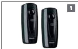
CENTSYS Photon SMART Infrared beams Wireless infrared beams. Always recommended on any automated installation