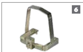
Theft-resistant cage & padlock Retro-installable steel cage that increases the resistance of the operator against theft