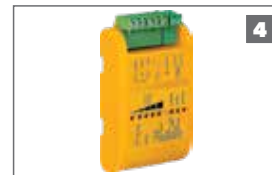
FLUX SA Loop Detector Allows free-exit of vehicles from the property - requires ground loop to be fitted