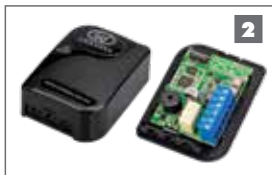
WiZo-Link module Wireless input-output module using mesh network technology creating fully-wireless connections between devices