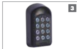
SMARTGUARD or SMARTGUARDair keypad Cost-effective and versatile wired and wireless keypads, allowing access to pedestrians