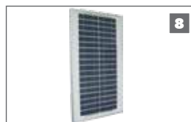
Solar supply Alternative means of powering the system - consult your CENTSYS dealer