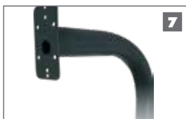
Gooseneck Steel pole for mounting intercom gate station or access control reader