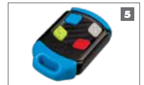
CENTSYS transmitters Available in one-, two- and four-button variants. Incorporates code-hopping encryption