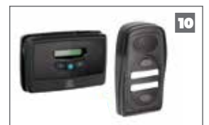
Wireless intercom systems Answer your intercom and open your gate from anywhere for maximum security and convenience