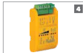
FLUX SA Loop Detector Allows free-exit of vehicles from the property - requires ground loop to be fitted